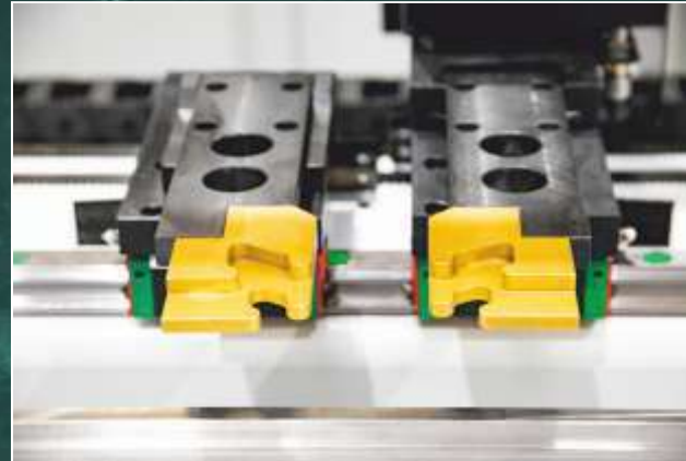
Multi AXIS 3D back gauge stop.