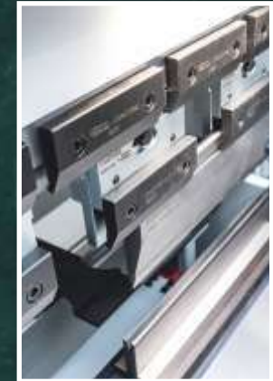
Promecam tooling (European style tooling).