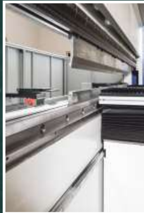
600 mm daylight (G-series). Wila tooling