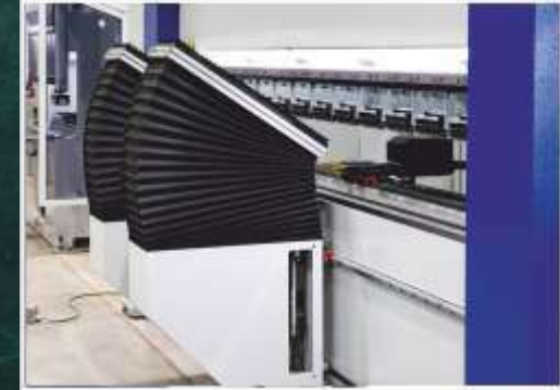
Servo electric sheet followers.