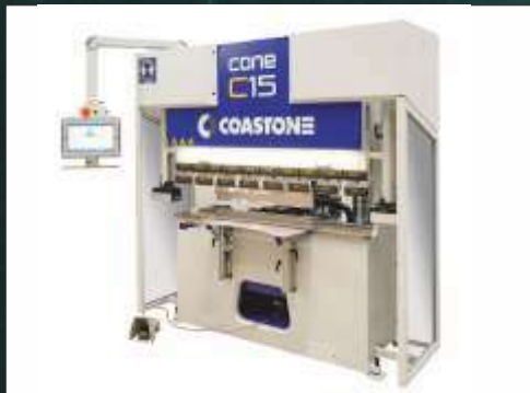
C-Series Cone C15, C-frame machine.