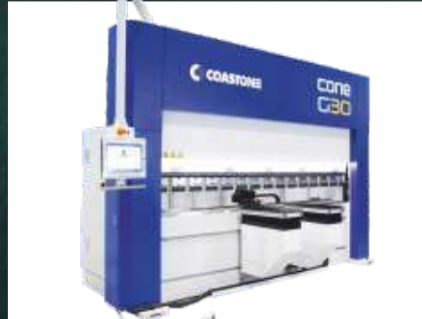
G-Series Cone G30. O-frame machine with sheet followers.